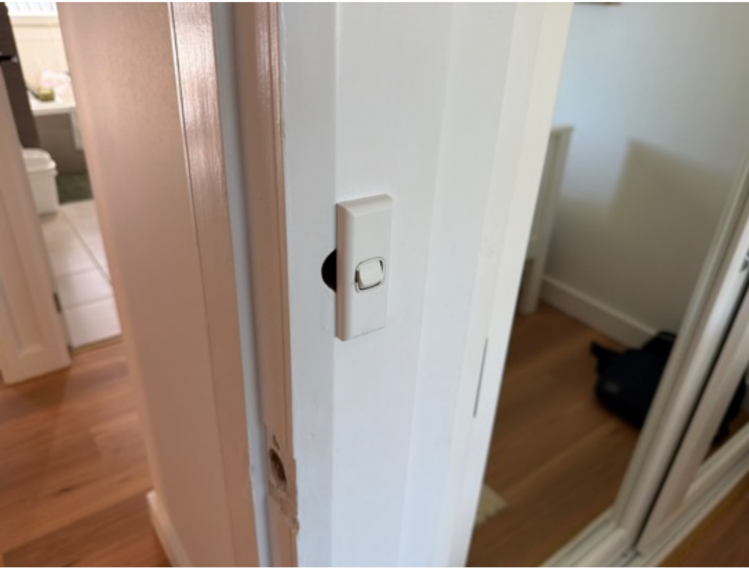
The light switch has a hole here.