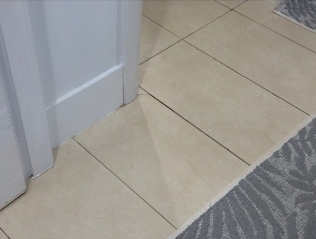
Isolated sections of tiles are cracked, consistent with age.