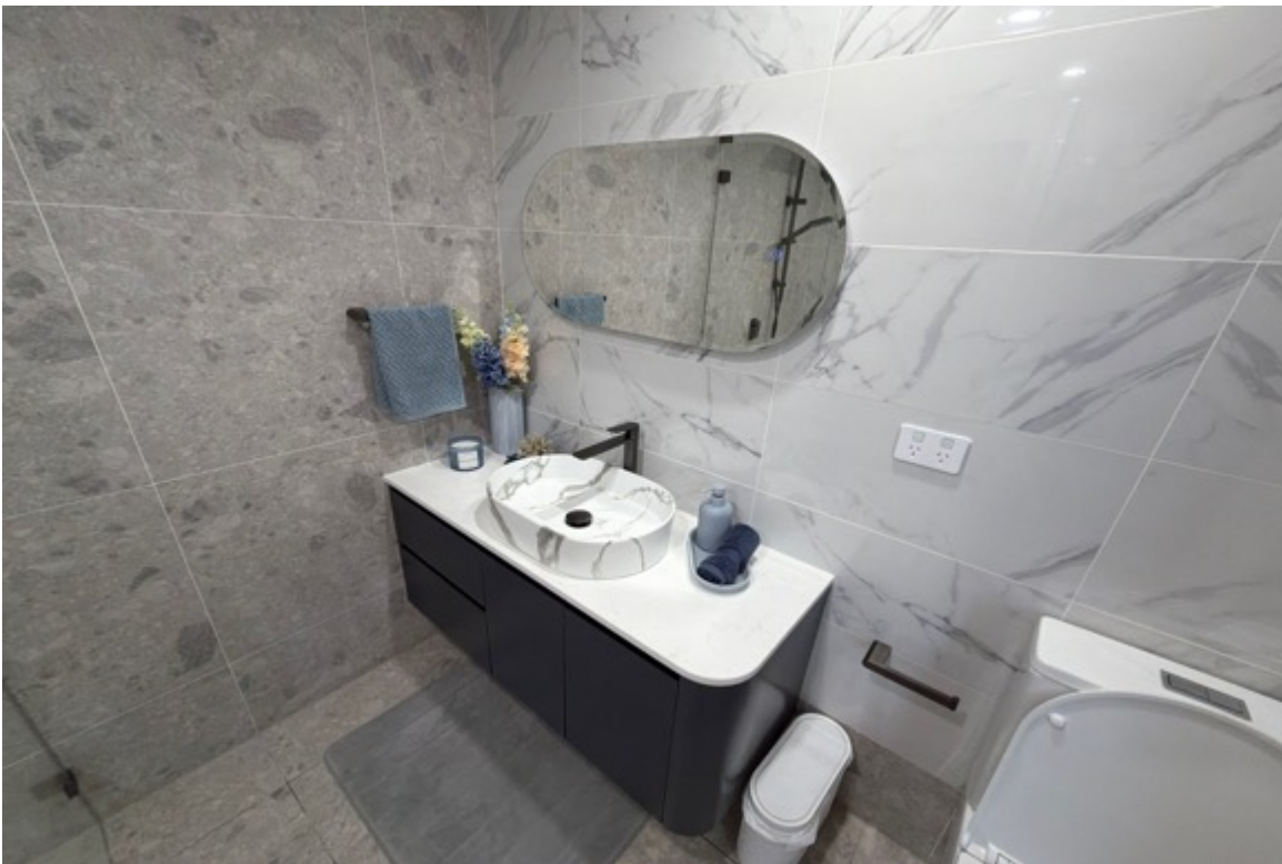
Water pressure tested, is sufficient.