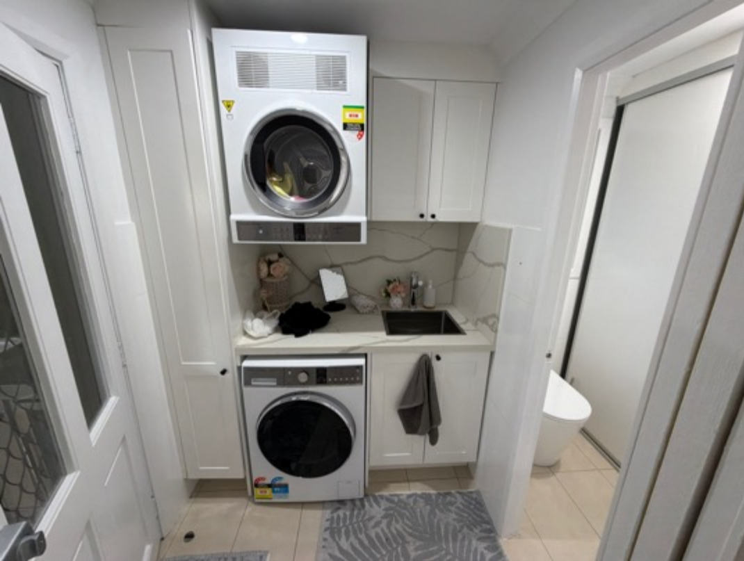
The laundry is in serviceable condition.