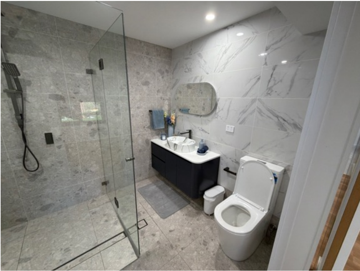
Common bathroom water services tested, functioned at the time of inspection.