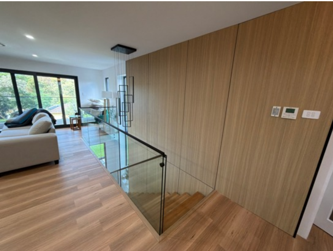
Interior railings checked are structurally sound.