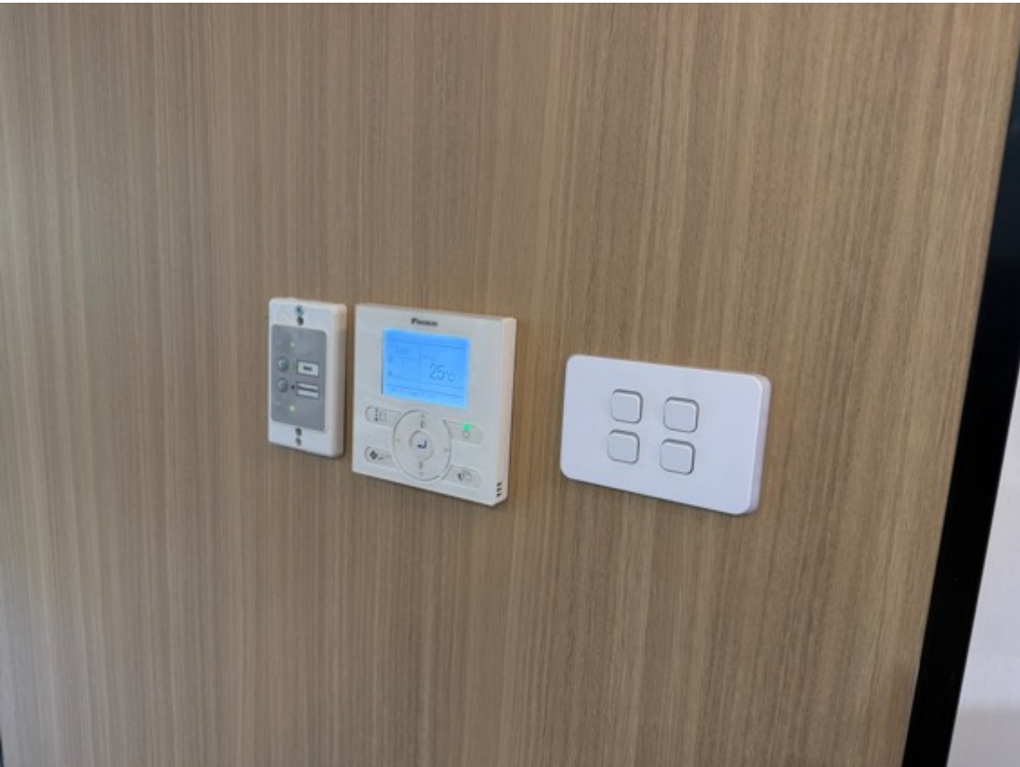
The AC tested, functioned at the time of inspection.