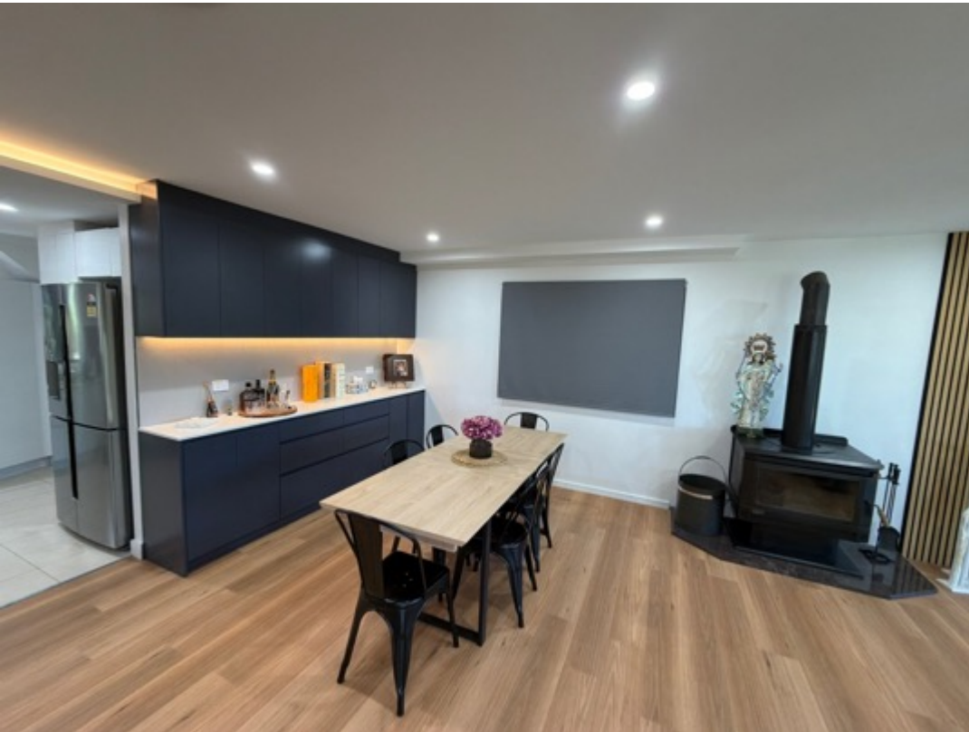
Example dining area above.