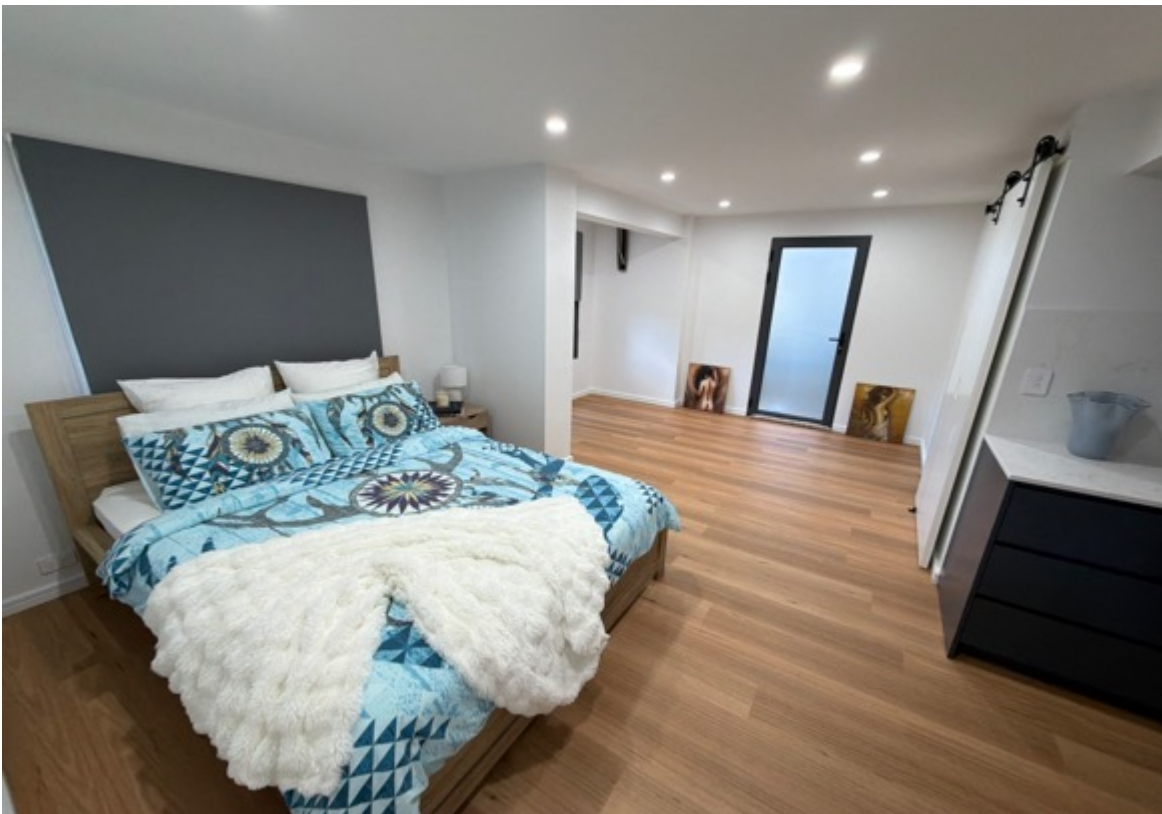
The ground floor granny flat is in serviceable condition.