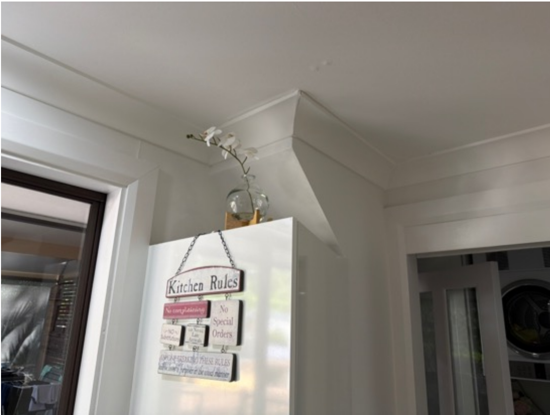
Sections of plasterboard and cornices are cracking, display imperfections.