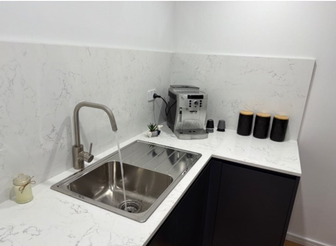
Water pressure tested, is sufficient.