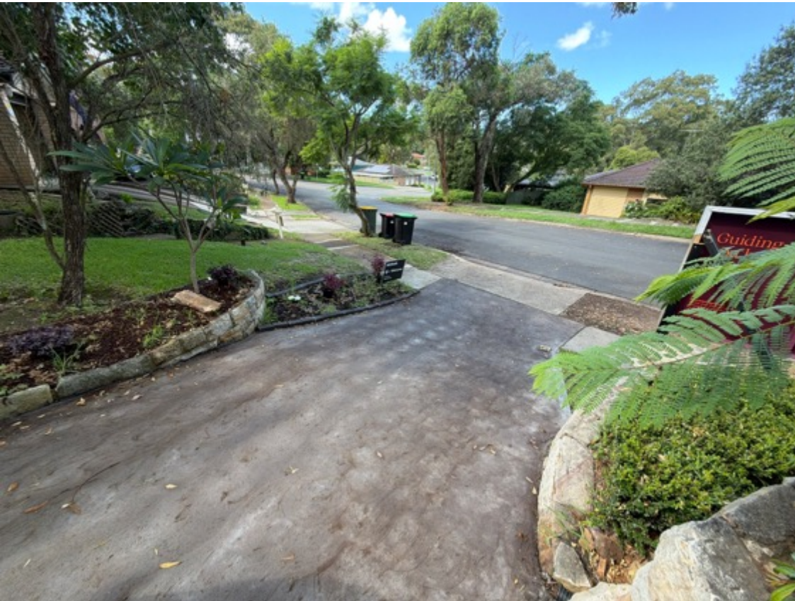
Isolated sections of exterior concrete displays typical shrinkage cracks and undulations - consistent with age.