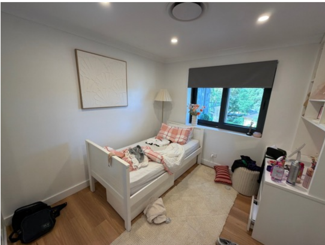
All interior lights tested, functioned as intended at the time of inspection.