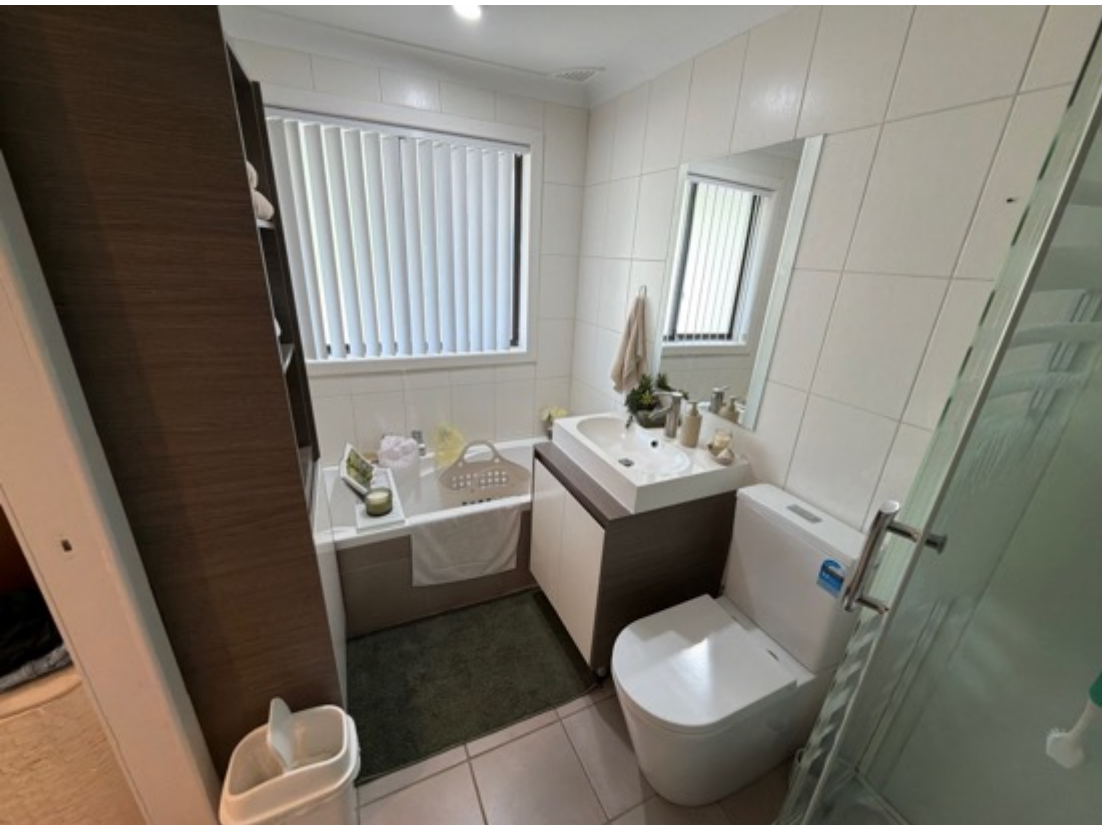
The ensuite bathroom area tested for leaks, fixings and stability was all clear at the time of inspection.