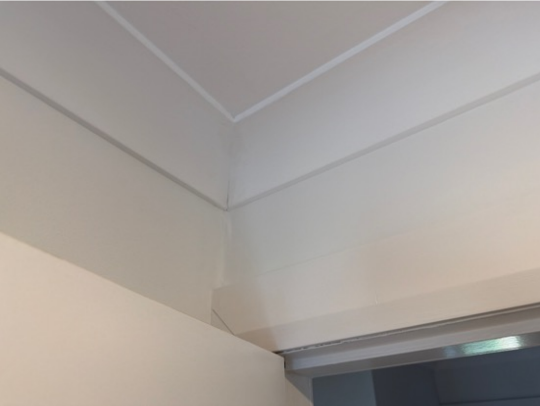
Plasterboard and cornices have minor blemishes and cracking visible (example above the main bedroom entry door.)