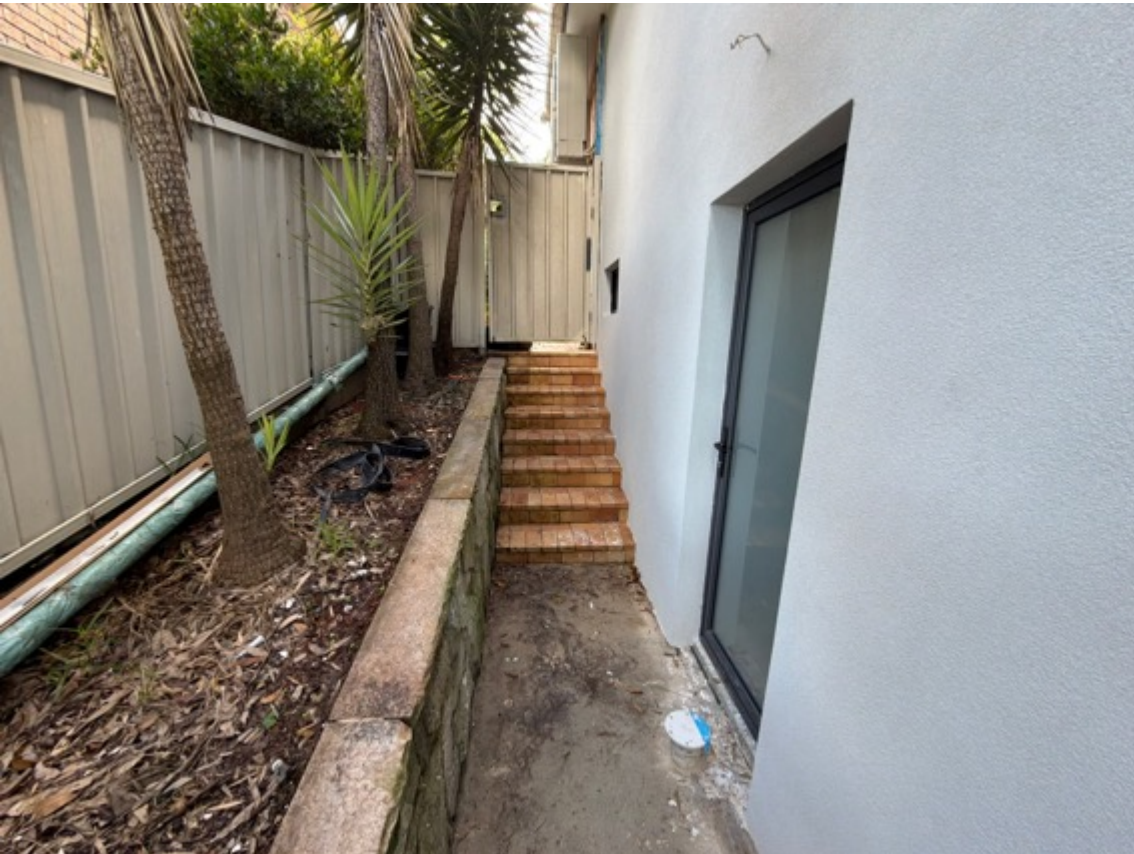
Site fences are in serviceable condition, isolated sections have a slight lean (consistent with age.)