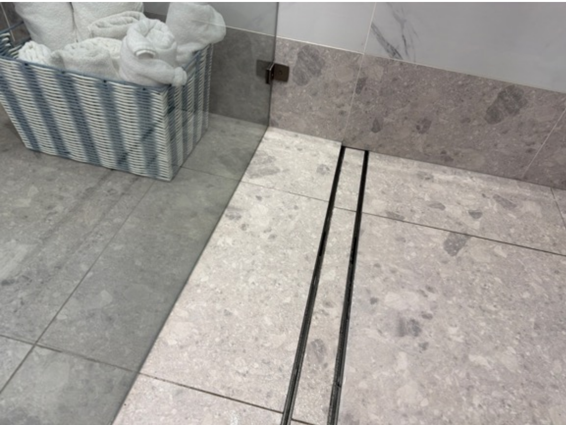
The grate drain finishes lower than the floor tiles.