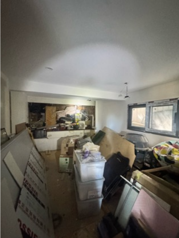
Garage works are incomplete - finishes, drainage, painting etc.