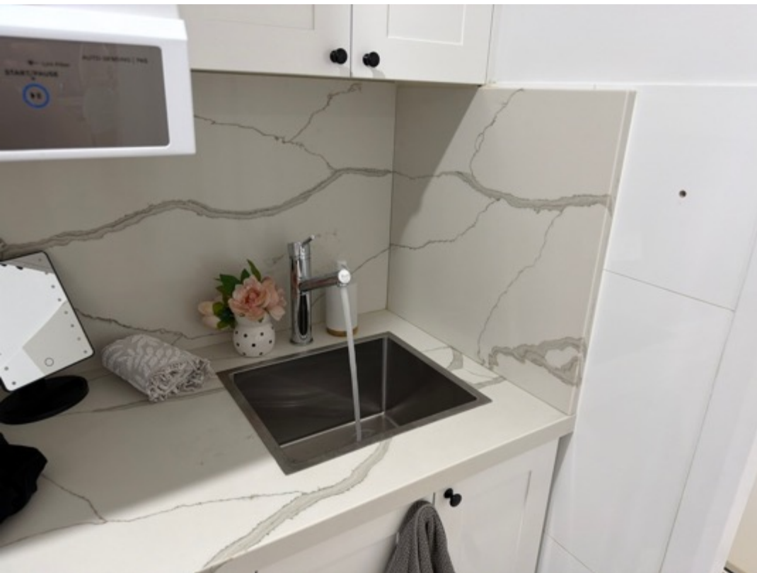
Water pressure tested, is sufficient.