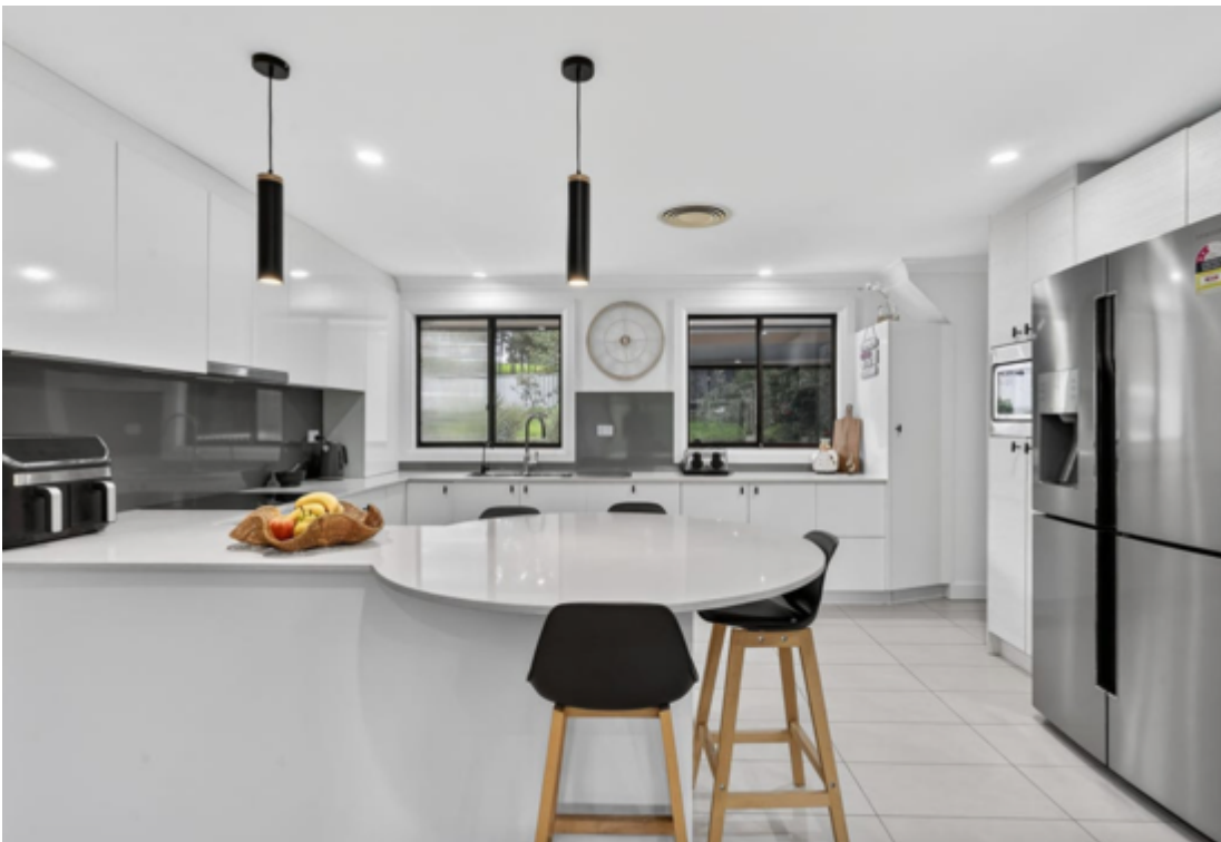
Appliances tested, functioned at the time of inspection.