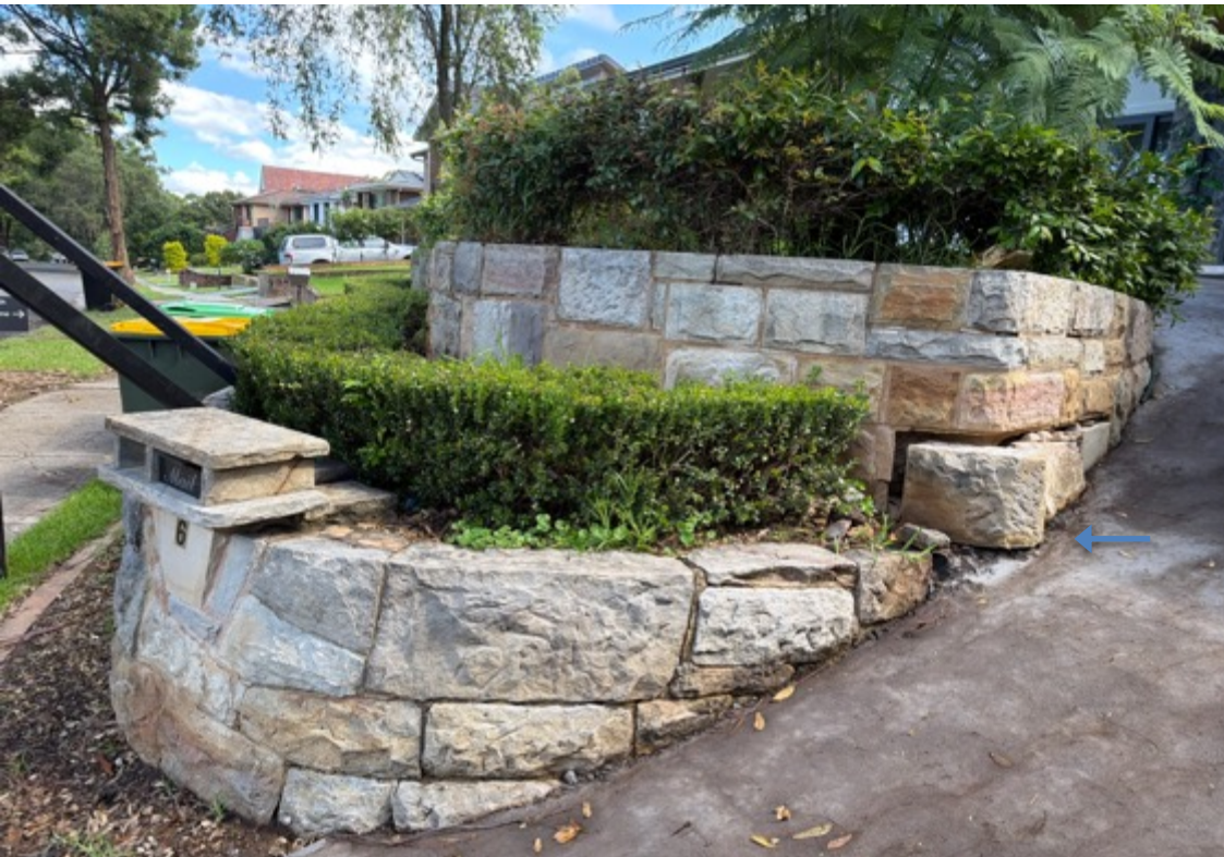
Sections of sandstone garden edging is damaged, requires remedial works.