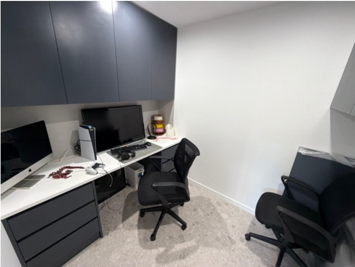
The ground floor common area is in serviceable condition.