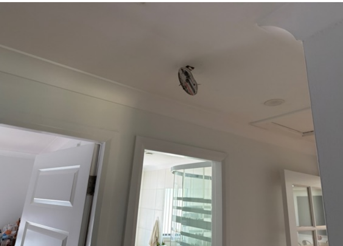
The smoke detector requires checking by a licensed electrician.