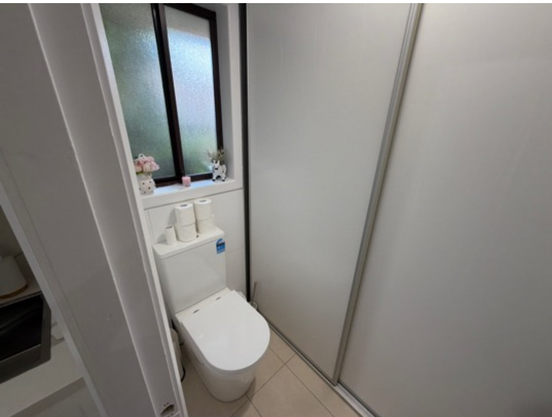
The common toilet tested, functioned at the time of inspection.