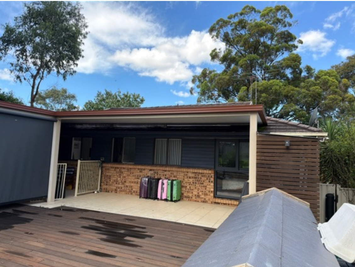
Exterior windows and doors present in satisfactory condition for the age.