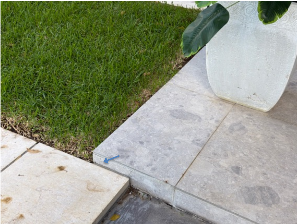
Isolated sections of external tiles are cracked, consistent with age (front patio example above.)