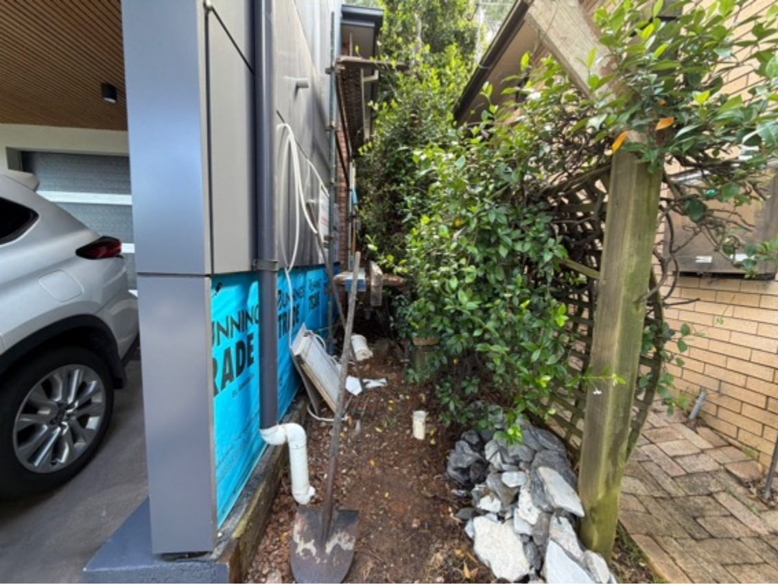
The right side elevation has sections of incomplete work.