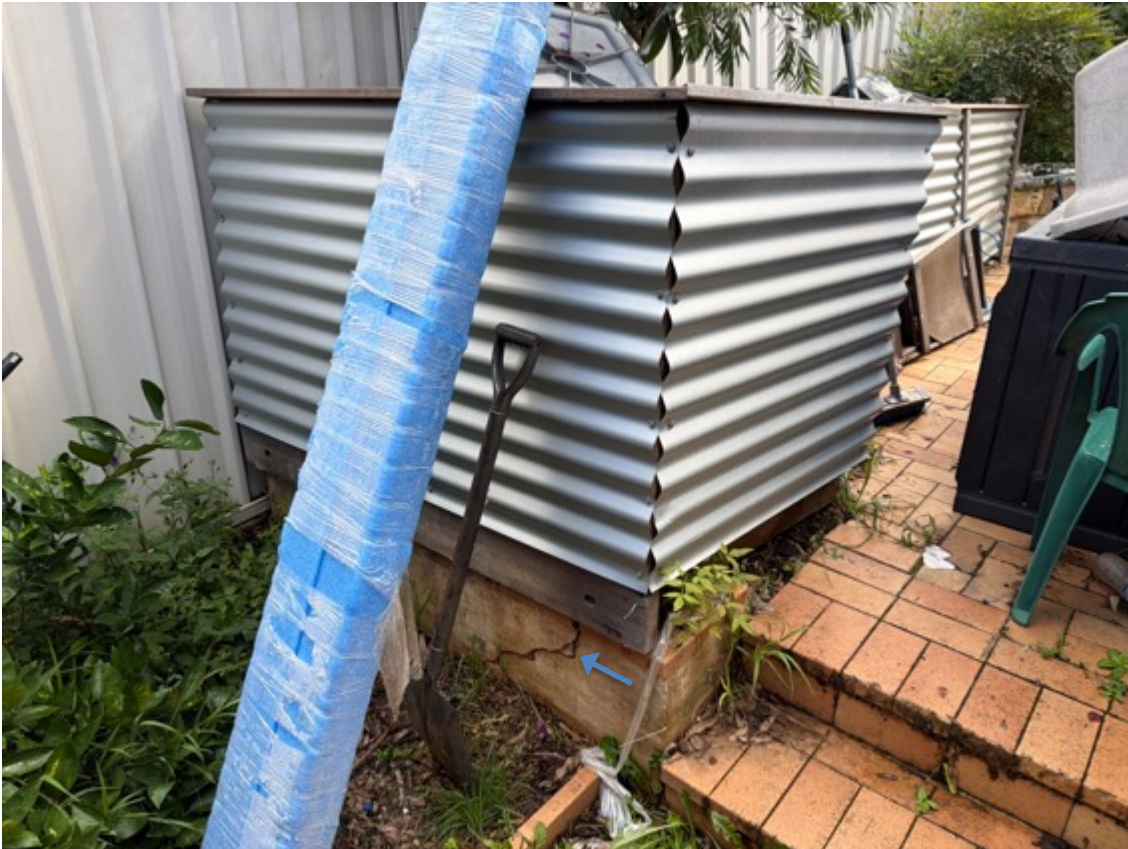
Rear left elevation render is cracking here.