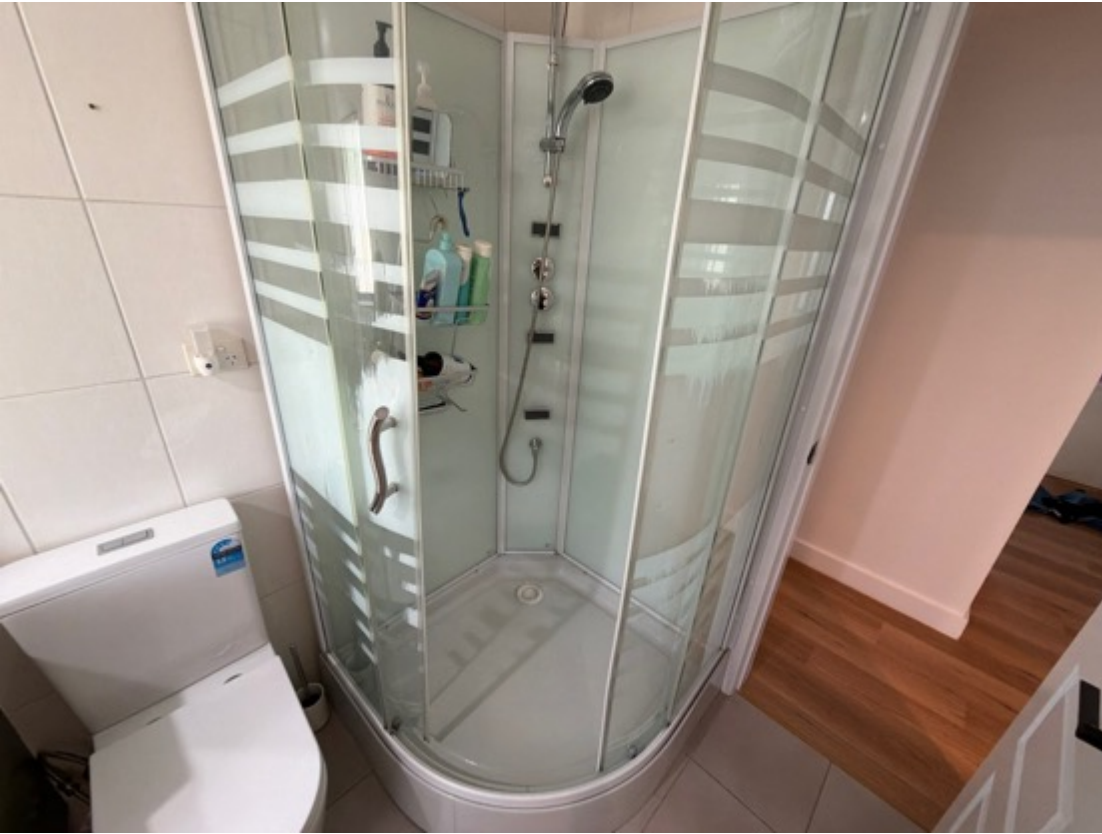
Hot and cold water services tested, functioned as intended at the time of inspection.