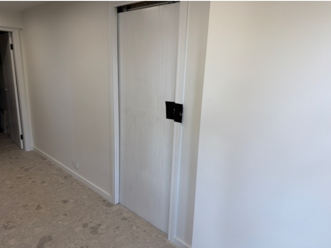
The garage sliding door painting is patchy.