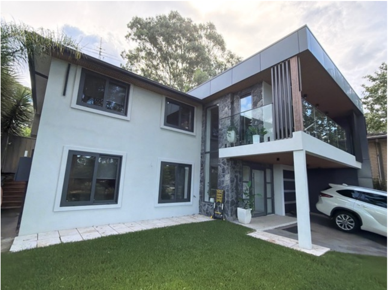
6 RENNELL STREET KINGS PARK.

Front elevation of the Inspected property inspected.