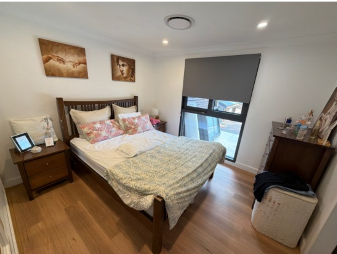
The main bedroom area presents in satisfactory condition for the age.