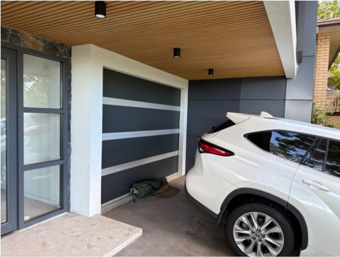
The garage roller door tested, functioned at the time of inspection.