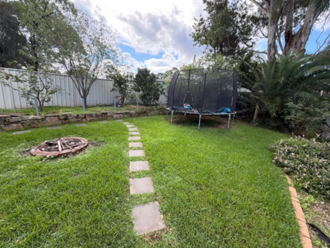
Rear yard example above.