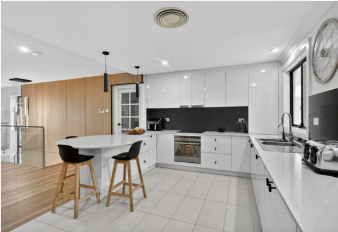
The kitchen area presents in satisfactory condition.