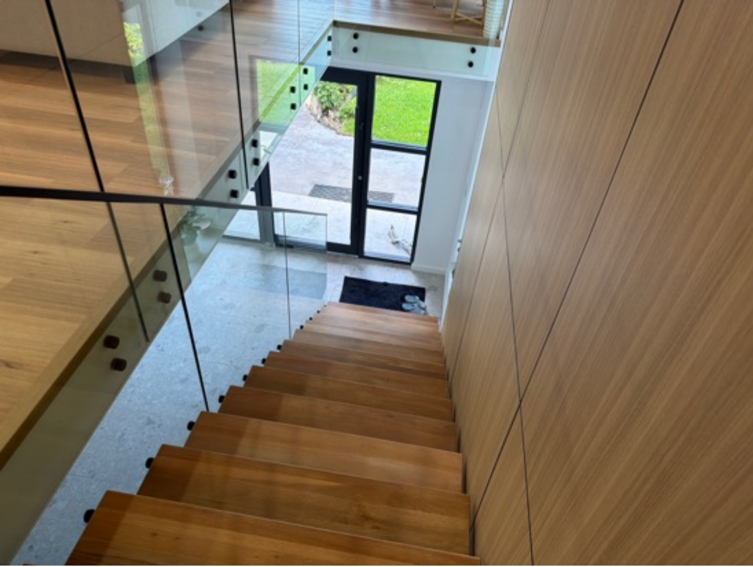
Staircase steps feel uneven under foot.