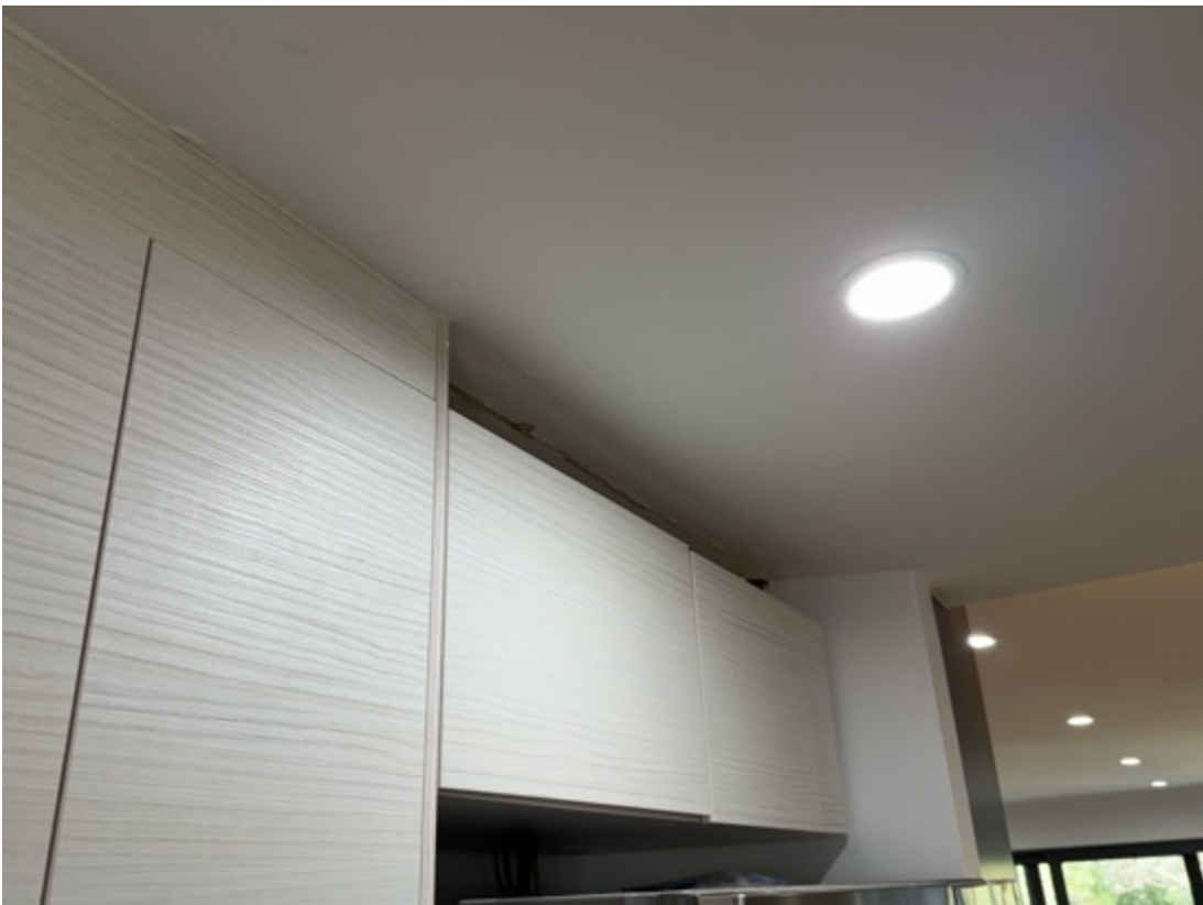
Sections of internal works are incomplete (kitchen example above.)