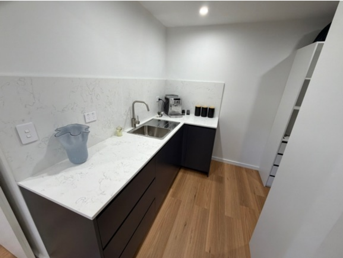
The kitchenette is in serviceable condition.