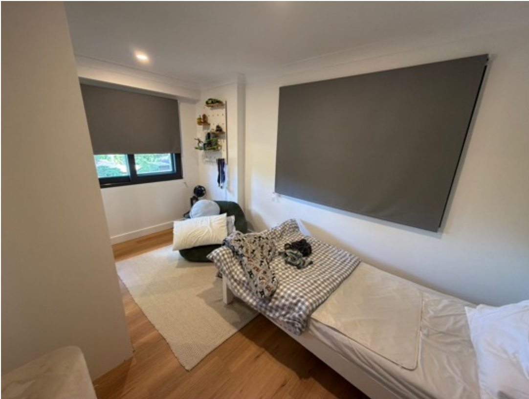
Interior bedroom areas present in satisfactory condition for the age.