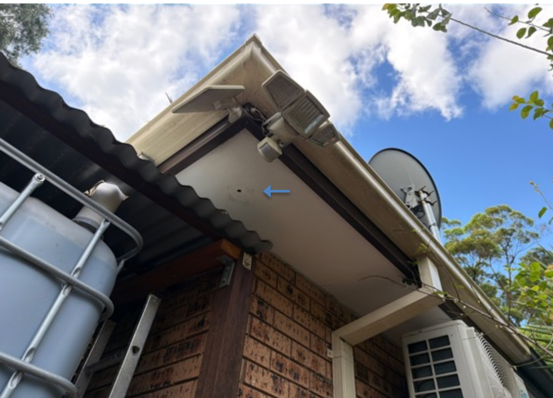
Exterior surfaces display low level paint blemishes, and the rear left elevation eaves lining has been patched here.