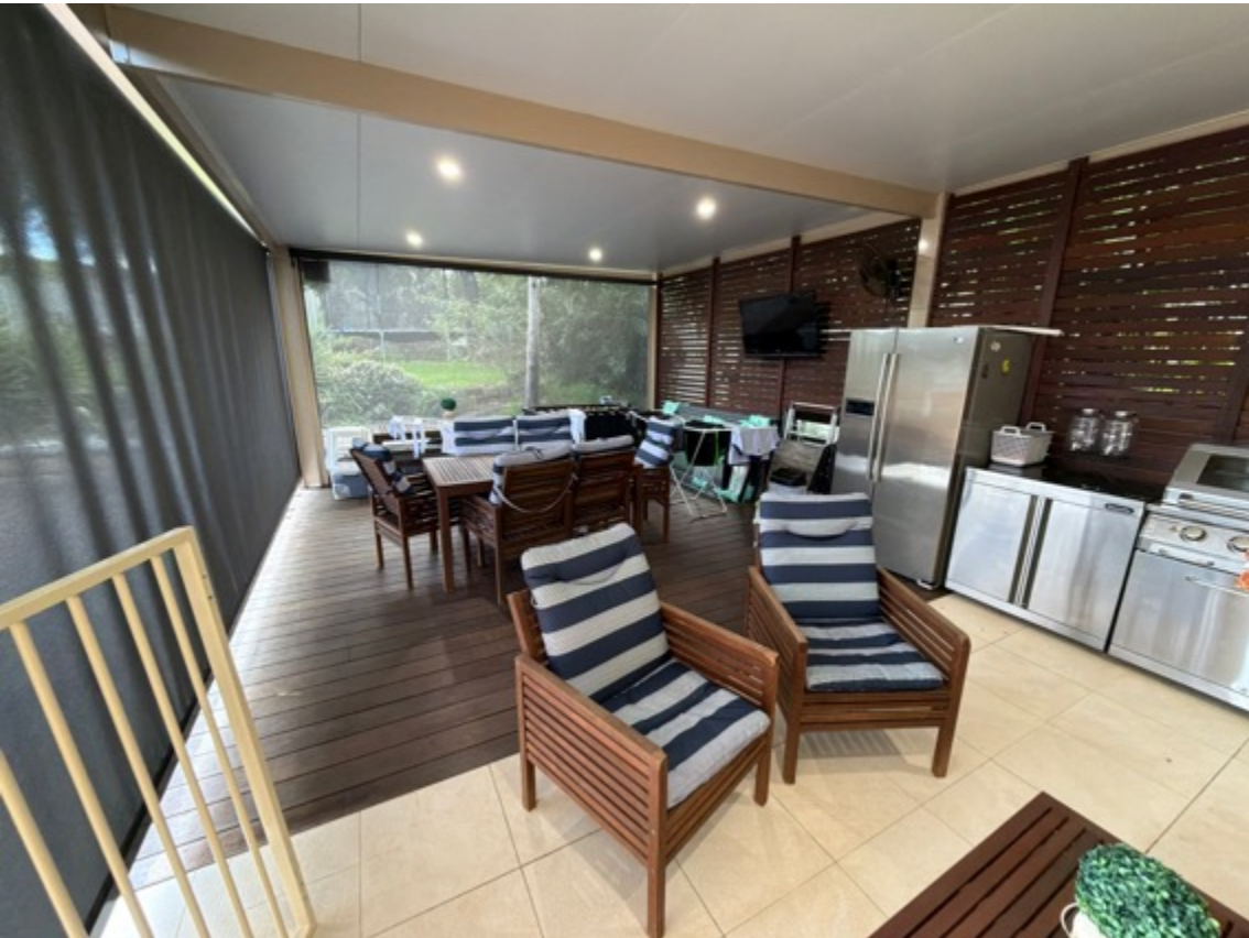
The rear pergola checked is structurally sound.