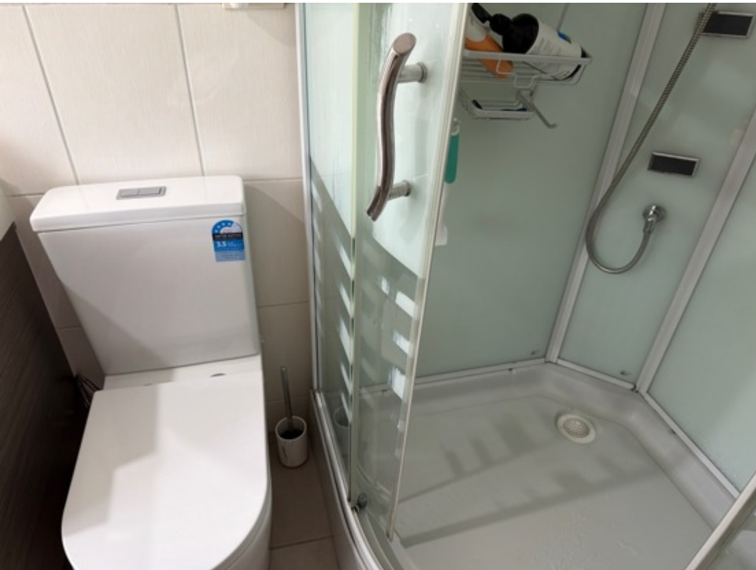
The shower door slider is loose.